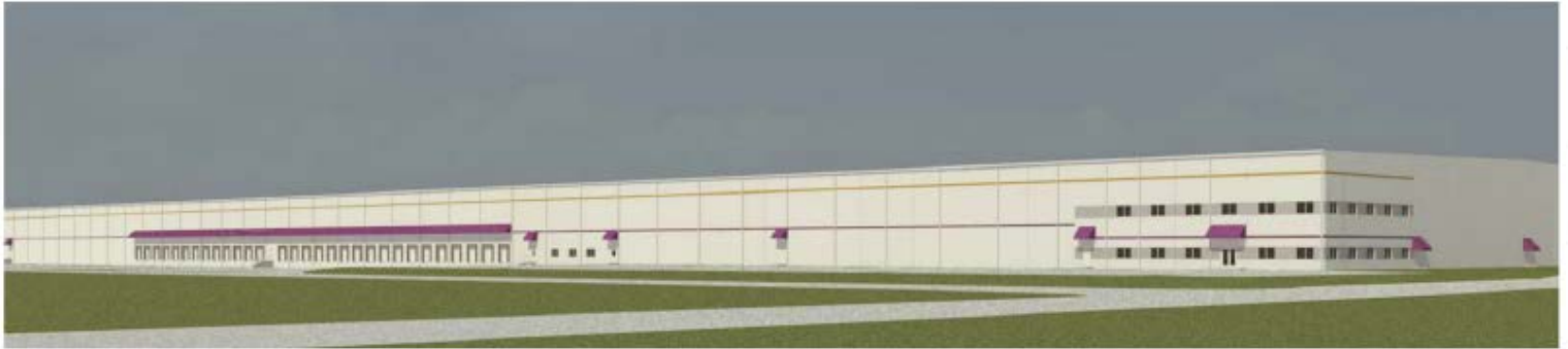
Render 3D View 2