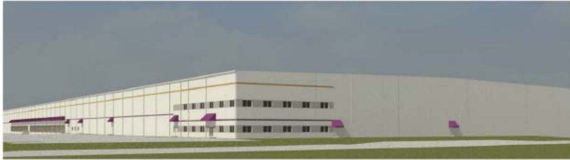
Render 3D View 1

119 WEST 57TH STREET | PENTHOUSE | NEW YORK, NY 10019 | 212.277.7500 WWW.PANTHEONPROPERTIES.COM