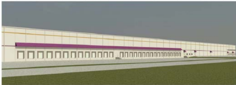
Render 3D View 3

FOR FURTHER INFORMATION PLEASE CONTACT EXCLUSIVE BROKER: PANTHEON PROPERTIES GARY CAPETTA 212-277-7500 LEASING@PANTHEONPROPERTIES.COM OR VISIT US ON THE WEB : WWW.PANTHEONPROPERTIES.COM